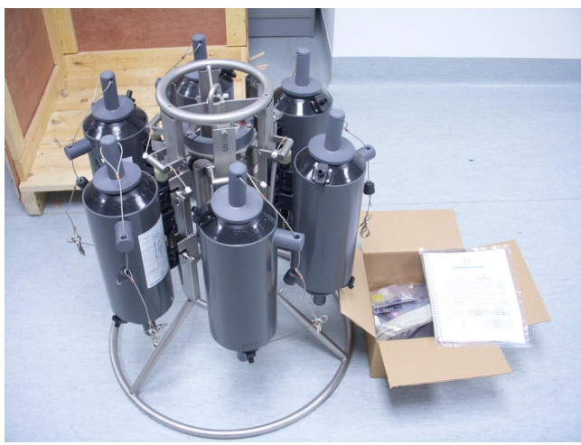
多通道水样采集器 Slimline, 6X3.5L