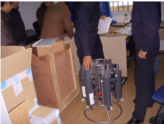
用于多通道水样采集器 Slimline, 6X1L