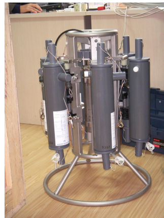
多通道水样采集器 Slimline, 6X1L